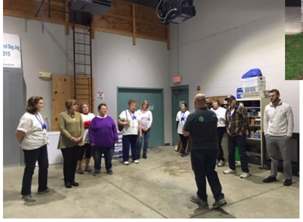
Volunteers attend a training with KCAC staff